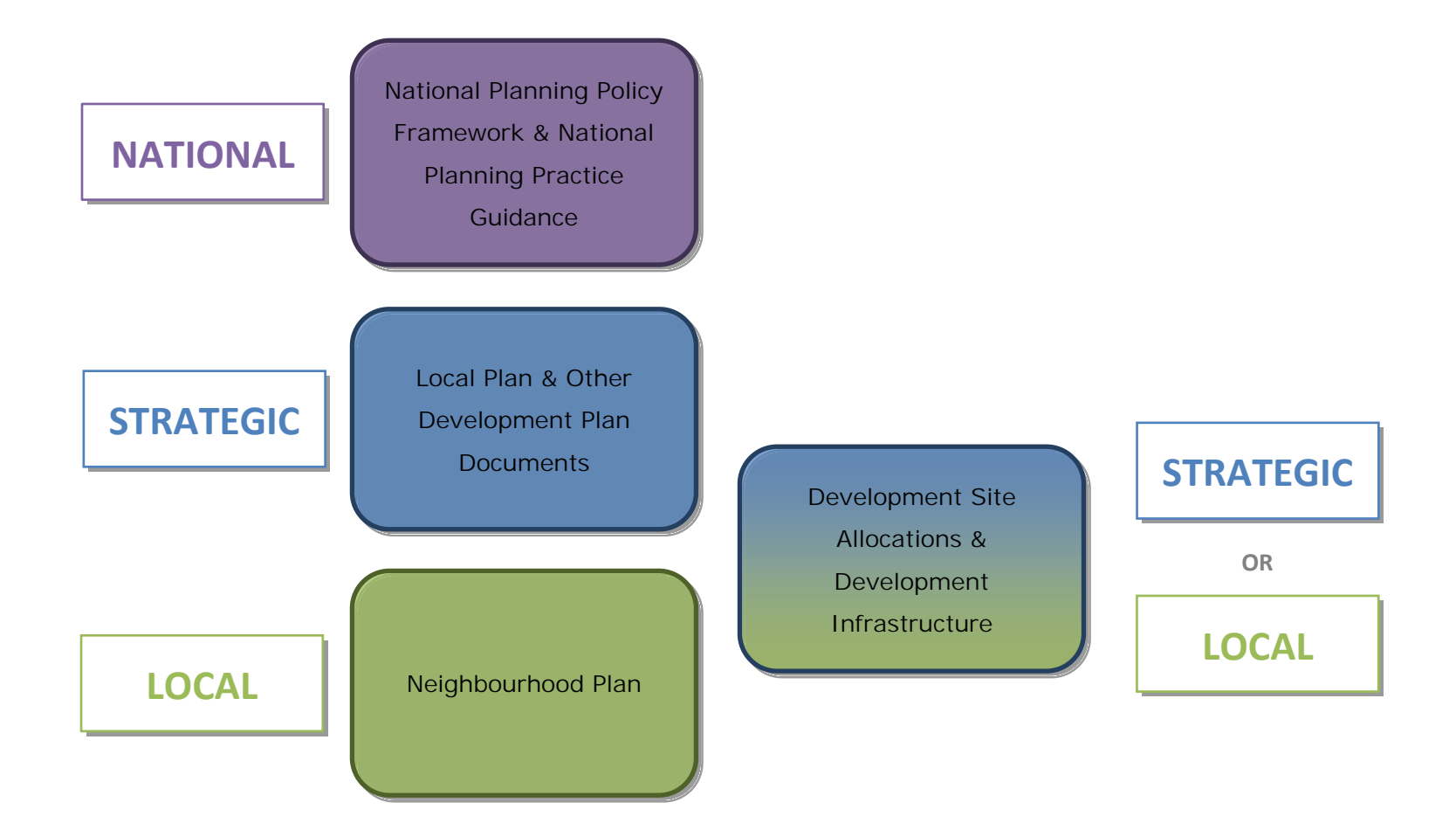
Figure 1 – Relationship between national, strategic and local planning policy